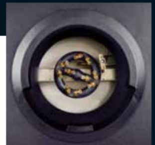
Powerful jet burner