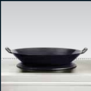
Stylish Chinese wok range