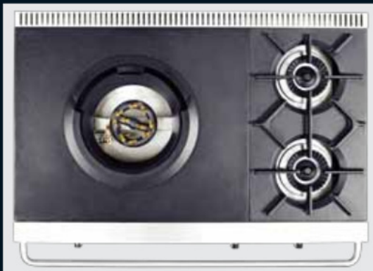
Unique combination of wok and burner range