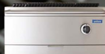
Outdoor gas char broiler for barbecue, CB-600